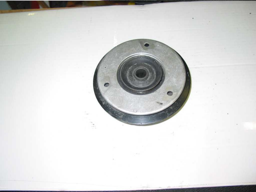
7. With a small diameter punch, drive out the remainder of the bolts and remove from the assembly.